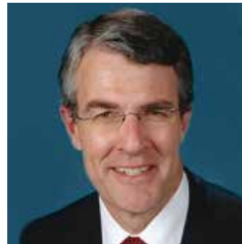
The Hon Mark Dreyfus QC MP

You can never completely protect your personal information from falling into the wrong hands. However, if you follow the advice in this booklet you can significantly reduce the risk.